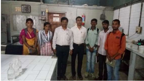
GOVERNMENT MILK SCHEME, UDGIR