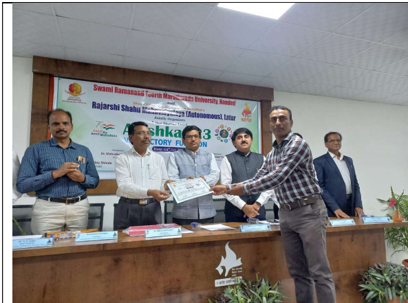
FIRST PRICE (RB Yedatkar-Faculty)