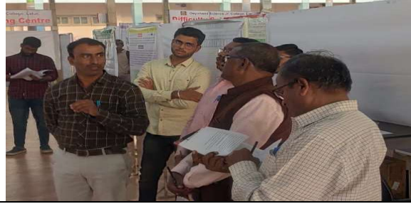
PARTICIPATION AND PRESENTED POSTER AND PPT IN AVISHKAR RESEARCH FESTIVAL COMPETITION