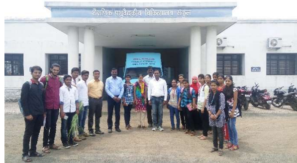
EDUCATIONAL VISIT TO AT COLLEGE OF VETERINARY AND ANIMAL SCIENCES, UDGIR (COVAS)