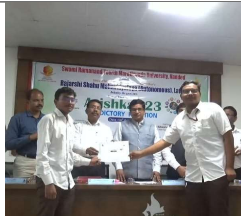
SECOND PRICE ( AS Tekale TY-Student)