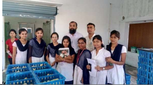
FIVE STAR POULTY AND HATCHERY CENTER, MALKAPUR, UDGIR