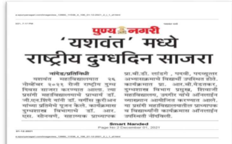
DELIVERED LECTURE ON THE OCCATION OF NATIONAL MILK DAY 26 TH NOV